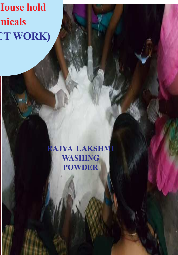
RAJYA LAKSHMI WASHING POWDER