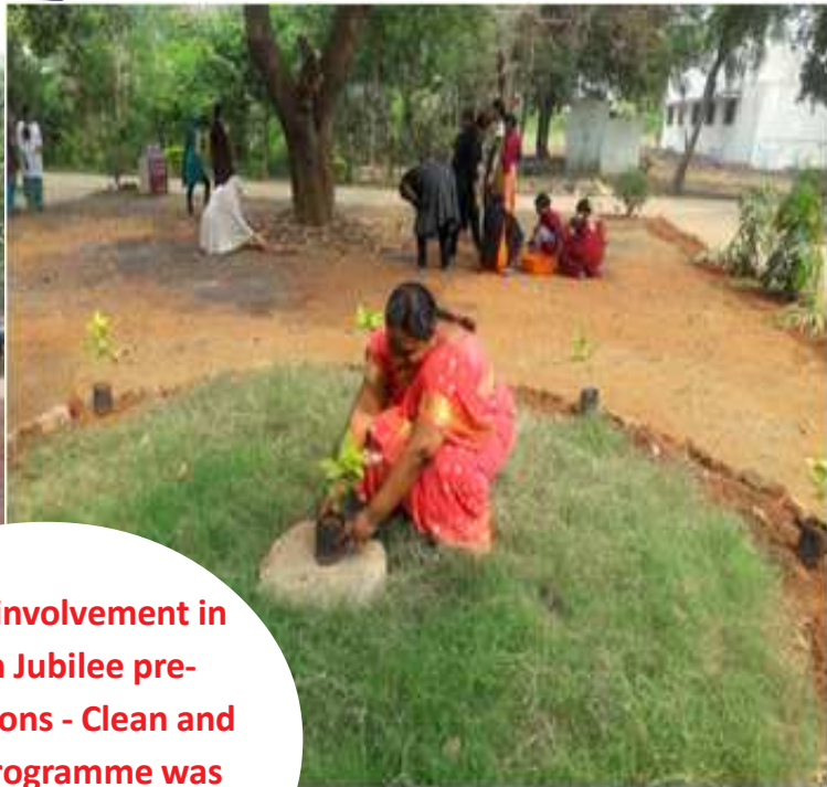
Student involvement in Golden Jubilee preparations - Clean and Green programme was held in front of the Chemistry Department.