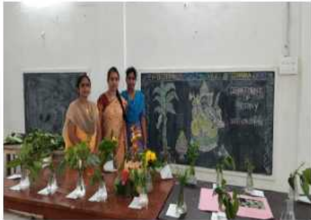
I B.Sc BZC (EM) Students at “Vinayaka Patri” Exhibition