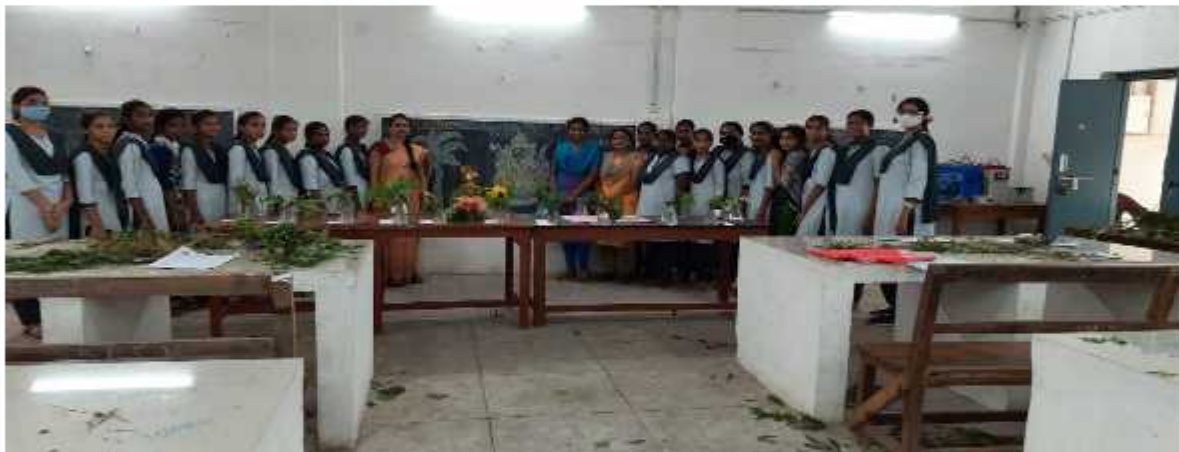
I B.Sc BZC (TM) Students at “Vinayaka Patri” Exhibition