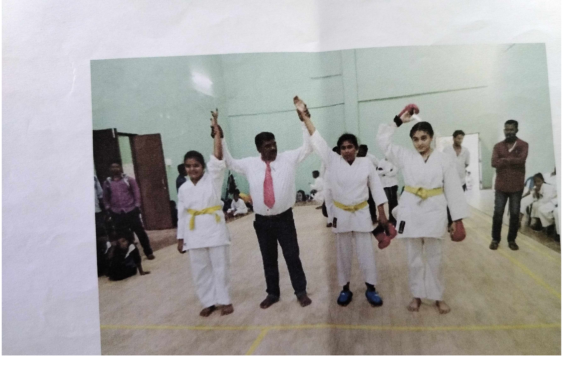
Scanned with ACE Scanner