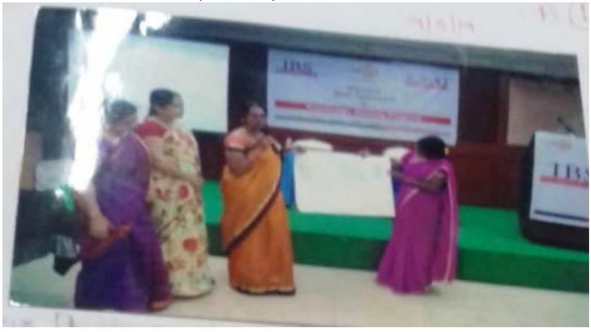
(Late) Kum.P.N.Prabhavathi Memoial lecture