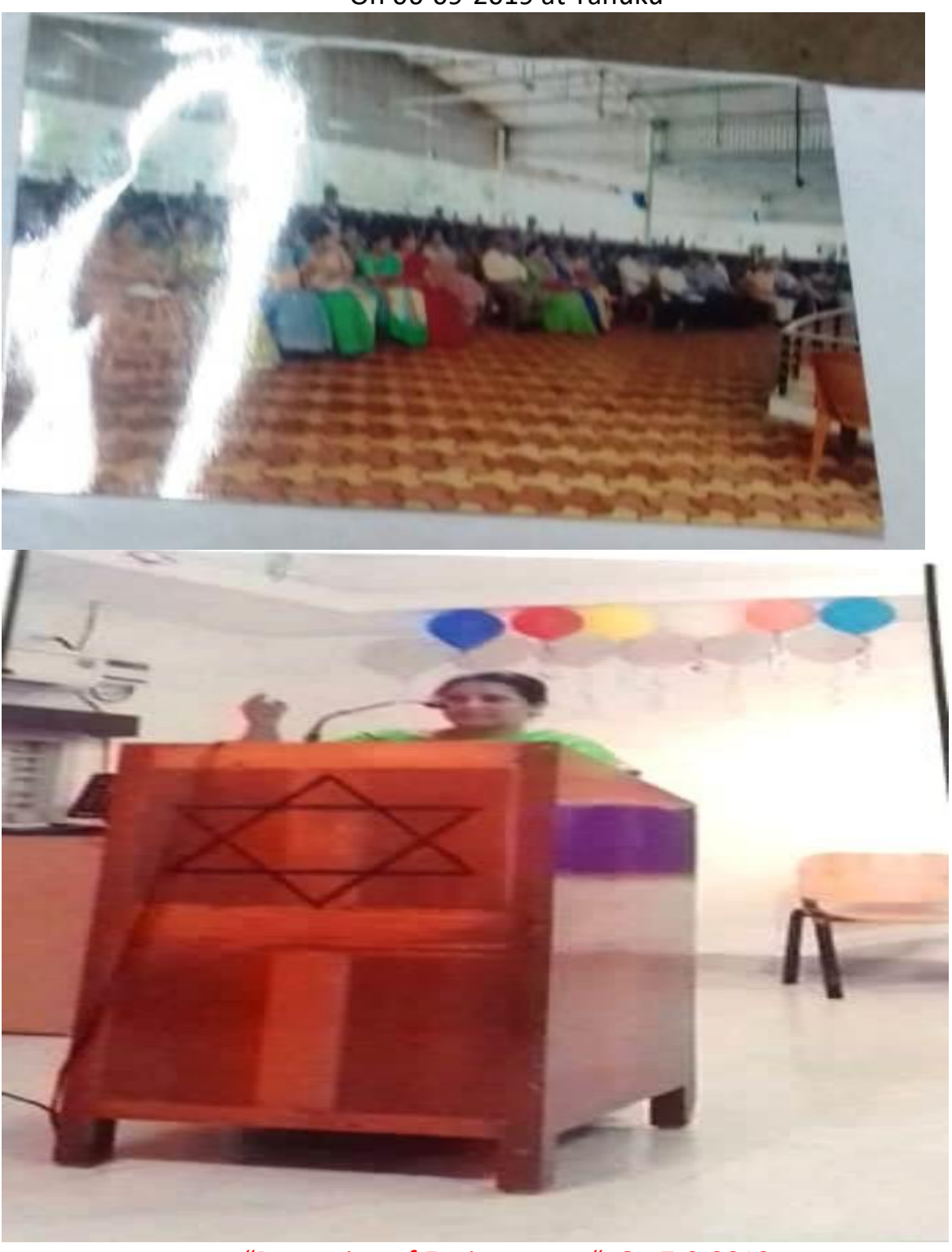
"Protection of Environment " On 7-9-2019