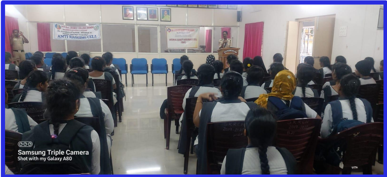
Samsung Triple Camera Shot with my Galaxy A80