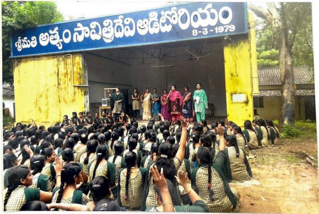
she called "SHE-TEAM" to address the Degree & Inter students.