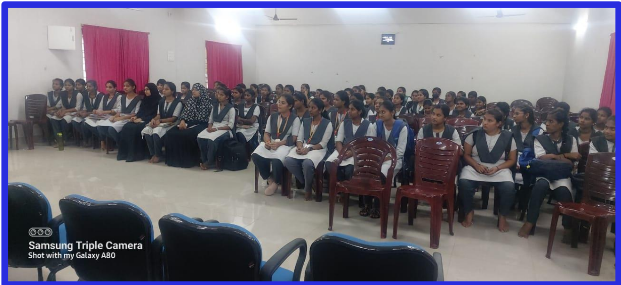
Samsung Triple Camera Shot with my Galaxy A80