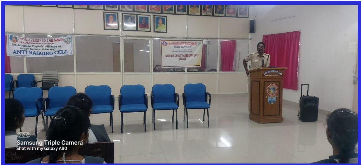
Samsung Triple Camera Shot with my Galaxy A80