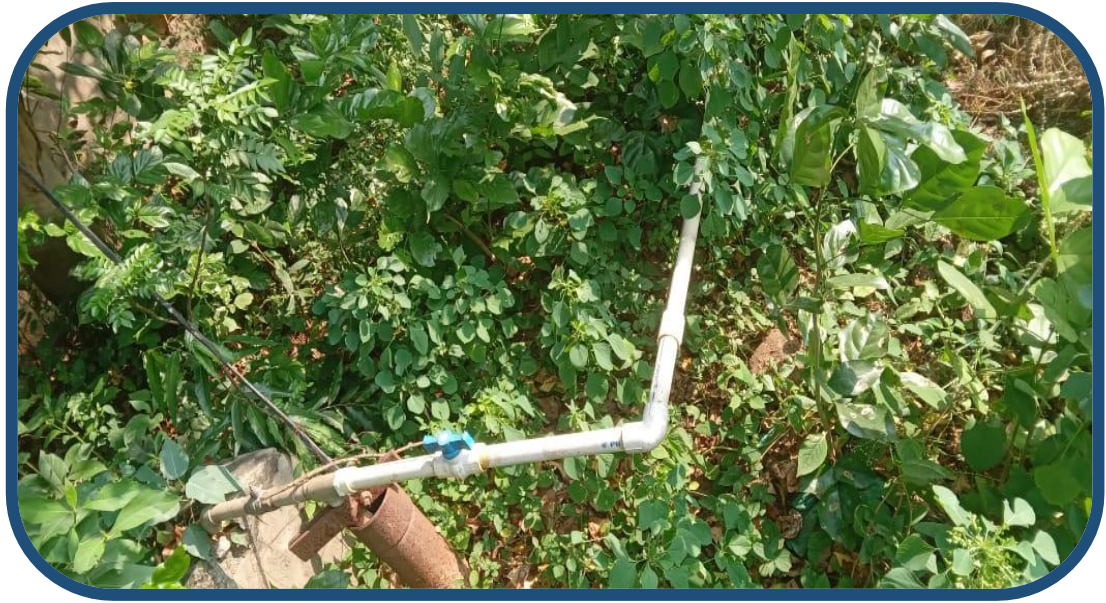
Waste water recycling -Maintenance of water bodies and distribution system in the campus